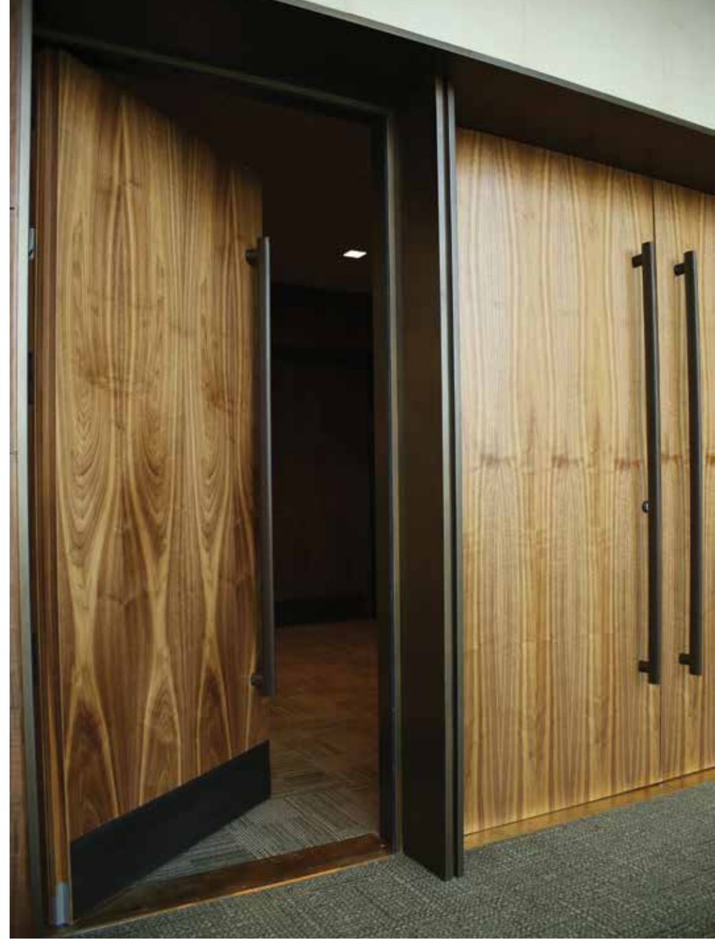
Acoustic wood veneer door assemblies

The acoustic perimeter and bottom seals were fine-tuned to allow closing under almost no power and to ensure ADA compliancy.