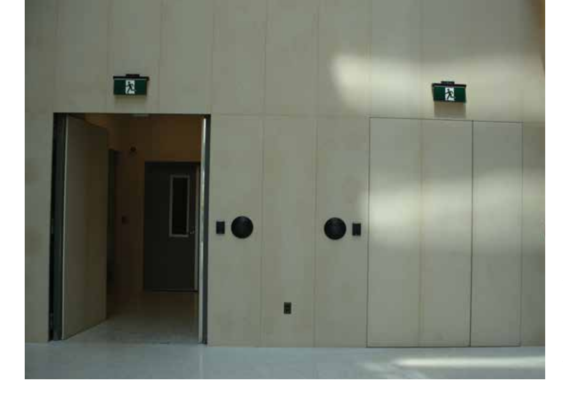
These acoustic door assemblies are slate-clad, designed to integrate with existing slate walls and are installed flush with the surrounding façade.

The architect and the design team envisioned the incorporation of elements from the large marble and glass tellers' area to the crush space in the new atrium. Marble was taken from the 1930's era structure and used in the new building, while stone was salvaged from the original structure and used on the new building's exterior.